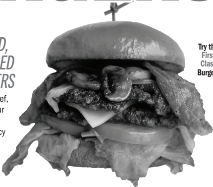
Try the First Class Burger!

Fresh cuts of select beef, hand-pressed onto our flat-top grill for that "old-school" crispy-juicy grilled burger "WOW."