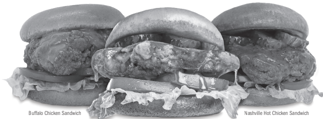
Buffalo Chicken Sandwich