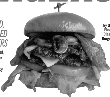
Try the First Class Burger!

Fresh cuts of select beef, hand-pressed onto our flat-top grill for that "old-school" crispy-juicy grilled burger "WOW."